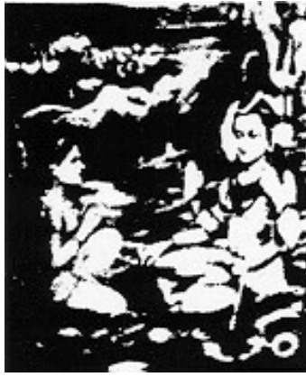
Lord Siva teaches Kundalini Pranayam to Parvathi Devi

I pine for ADISVARA AMARANATHAR who first taught the science of Hatha Yogam in the pre-Aryan Dravidian Tamil Nadu and Kundalini Pranayam to Parvathi Devi in the Himalaya Parvatham, so that the jiva will become S H I VA.