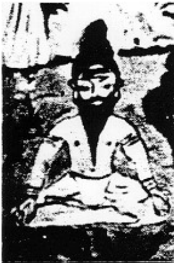
SAGE AGASTYA Father of the Tamil Language One of the 18 Tamil Yoga Siddhas and Guru of Babaji

I humbly bow with ettu-anga-vanakka mudrai to the greatest, of all the siddhas, Paramguru Irudi Agathiyar who brought serenity of mind through Dhyana Yogam, clarity of speech through his work on Tamil grammar. purity, of body by his works on siddha vaidhyam and immortalization of the annamaya uruvam through Kundalini Yogam.